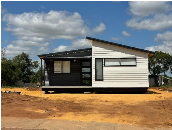
New house in Stephen Street, Northampton

The Shire has recently had our first cost-effective modular house delivered to Northampton on Stephen Street. This house will be used as primarily as staff housing as we prepare for economic growth in the district due to prospective renewable energy/hydrogen, mining and tourism projects.