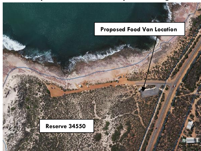
Figure 3 – Proposed location - Jacques Point gravel carpark