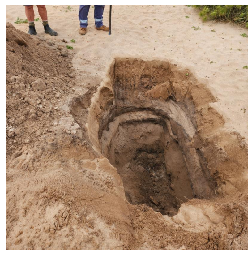
Chinaman's Beach - Test Pit – central location along work site

Figure 2 Chinaman's Beach – Test Pit – location near the existing shelter (south eastern extent of the work area)